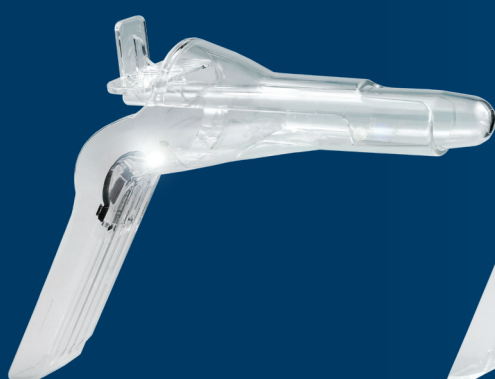
90 mm x 18 mm Slotted

Ready for Use with an Integrated LED Light Source and Obturator