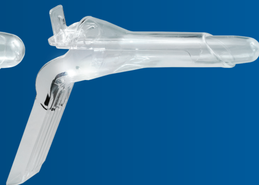
103 mm x 18 mm Beveled