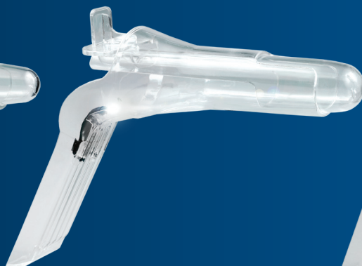
96 mm x 23 mm Slotted