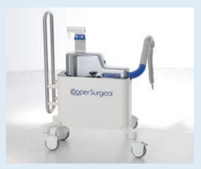
ALLY UPS Cart (shown with ALLY UPS)