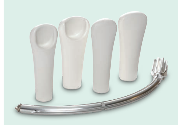
Hoyte Sacro Tips for Vaginal Prolapse Repair Are Ideally Suited for Use With the ALLY UPS

ALLY UPS ensures steady cephalad pressure, helping to increase the distance between the ureters and other critical anatomy during dissection. Establishing these landmarks and distancing vital anatomy can prevent complications while performing the colpotomy incision.