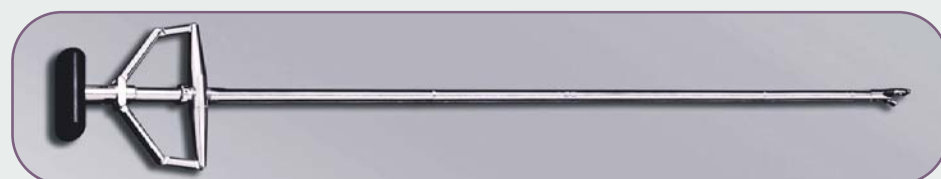
Single-Incision (Available in 5mm, 7.5mm, and 8mm sizes)