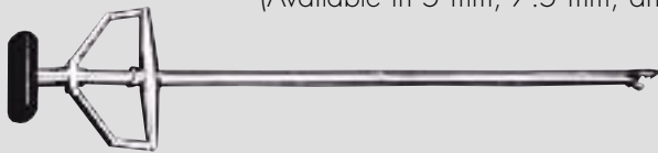
7 mm Dual-Incision