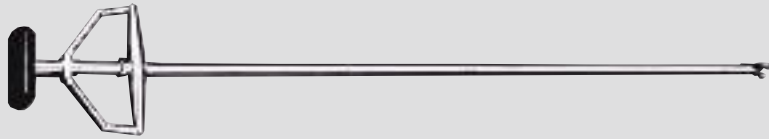
Single-Incision (Available in 5 mm, 7.5 mm, and 8 mm sizes)