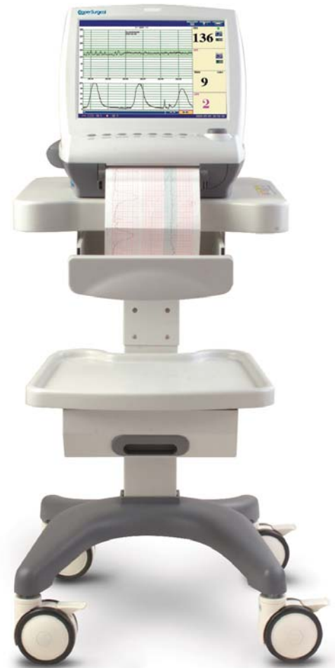
CooperSurgical F9 Fetal Monitor Shown on Deluxe Cart