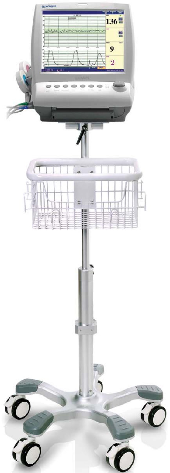
CooperSurgical F9 Fetal Monitor Shown on Base Cart with Basket